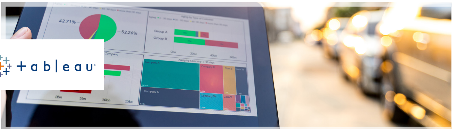
Tableau Springbrook Reporting and Analytics